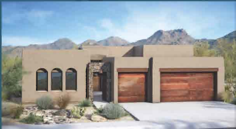
Three Car Garage + Stone Veneer