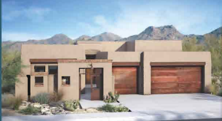
Three Car Garage Extended Courtyard + Brick Cap