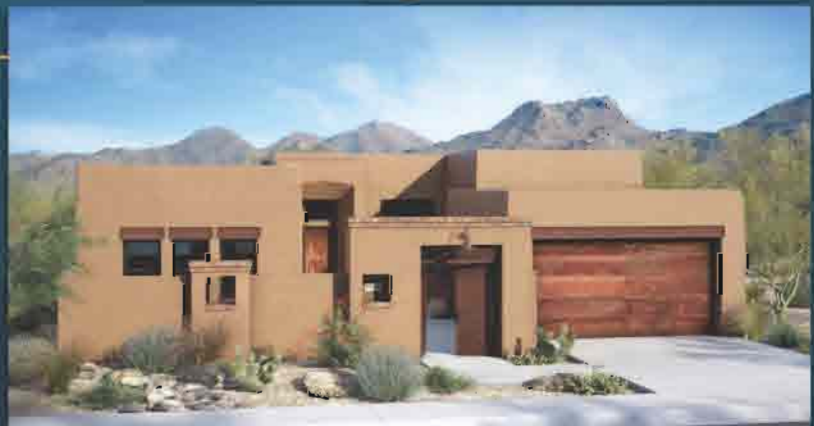
Extended Courtyard + Brick Cap